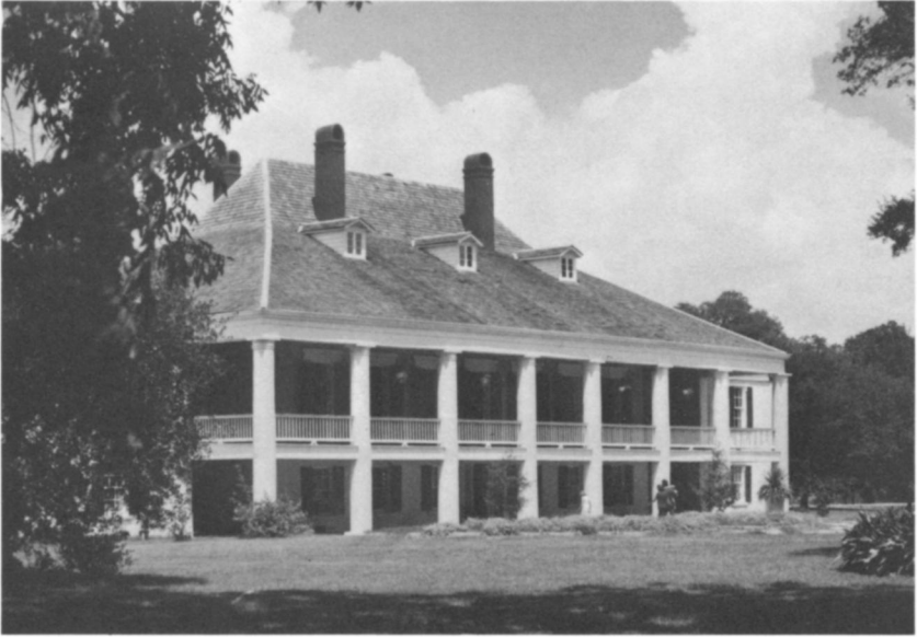
Destréban Plantation, scene of the trial of slaves involved in the 1811 uprising.