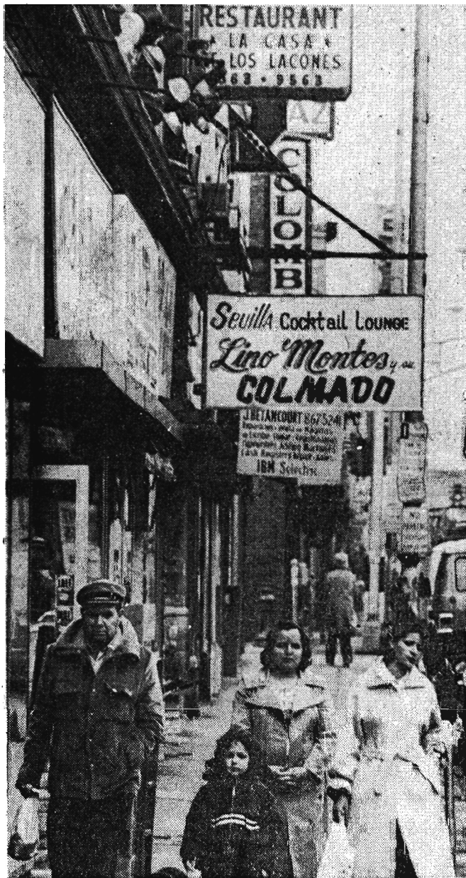
Shoppers in Cuban-American area of Bergenline Avenue in Union City, N.J.