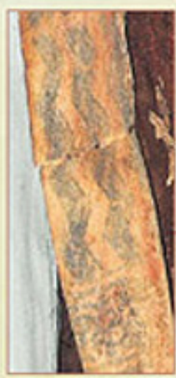
The designs on her right arm are spiders and snakes.

Among the most interesting details are the tattoos that the Señora wore on her two arms, her ankles and feet.