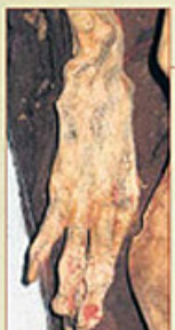
Intricate designs on her hands. Good skin preservation is thanks to cinnabar.